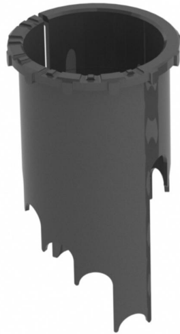
Original Travel Adjust Bushing